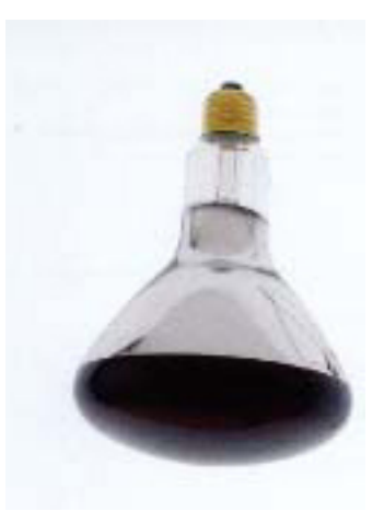
Figure 1: The best heat lamp is similar to this one.

You may obtain a small card containing this material from <u>Radio Shack</u> (part #267-1099). You will also need a TV or VCR remote control and an infrared lamp. The lamp should emit most of its energy in the form in the non-visible infrared portion of the spectrum. When it is on, the lamp should be a deep red color. These lamps are available at most hardware stores. (See Figure 1.) "Heat Lamps" which produce a white light will not work.